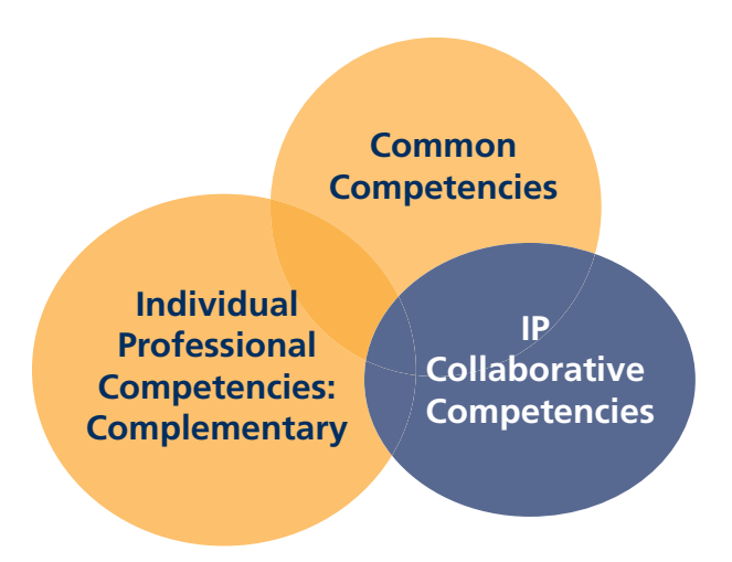
FIGURE 4: Barr's (1998) three types of professional competencies