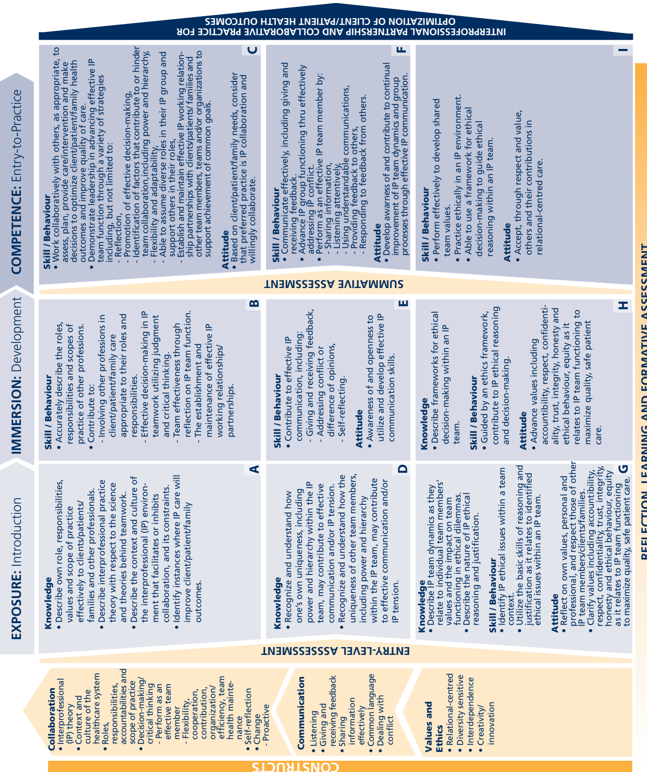
FIGURE 7: A Framework for the Development of Interprofessional Education Values and Core Competencies

Reprinted with permission from University of Toronto. (2008). Advancing the Interprofessional Education Curriculum 2009. Curriculum