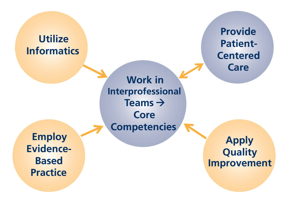
FIGURE 5: Interprofessional Teamwork and IOM CORE COMPETENCIES

Our report examines the further development of the core competency—work in interdisciplinary teams—identified in the 2003 IOM report. Although the IOM report named the key processes of communication, cooperation, coordination, and collaboration in teamwork, the interprofessional competencies that underpin these processes were not defined. Also important to the elaboration of teamwork competencies are the interrelationships with the other four IOM core competencies (see Figure 5). Provision of patient-centered care is the goal of interprofessional teamwork. The nature of the relationship between the patient and the team of health professionals is central to competency development for interprofessional collaborative practice. Without this kind of centeredness, interprofessional teamwork has little rationale. The other three core competencies, in the context of interprofessional teamwork , identify 21st-century technologies for teamwork communication and coordination (i.e., informatics), rely on the evidence base to inform teamwork processes and team-based care, and highlight the importance of continuous improvement efforts related to teamwork and team-based health care.